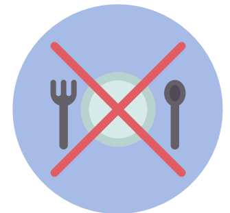
Loss of appetite