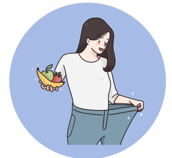
Unintentional weight loss