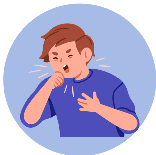
Coughing that lasts 3 or more weeks